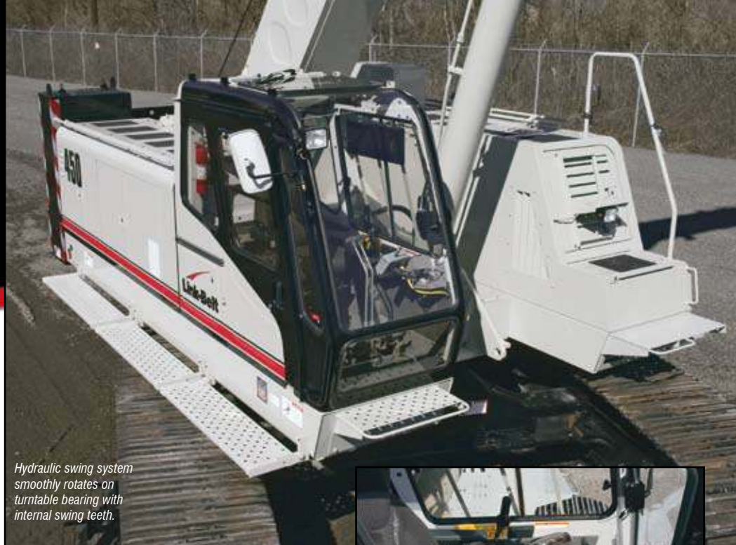
Hydraulic swing system smoothly rotates on turntable bearing with internal swing teeth.