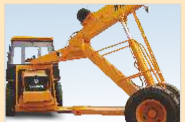
Minimum Turning Radius