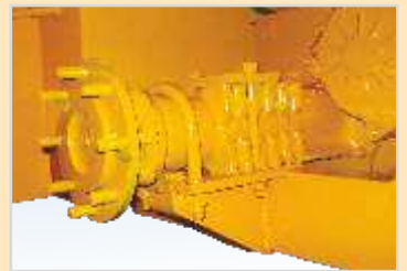
Straight Rear Axle