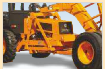
High Ground Clearance