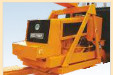
Full Length Chassis