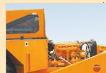
Easy for maintenance