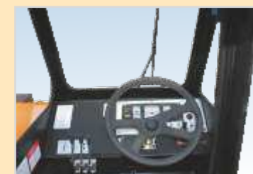
Four side more visibility cabin