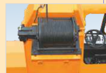
Heavy Duty Winch