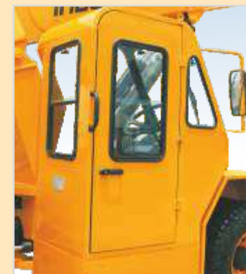
Cabin with better ergonomics