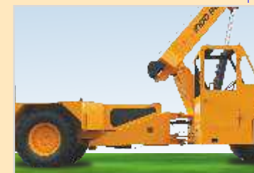
High Ground Clearance