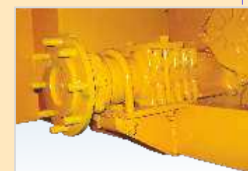
Straight Rear Axle