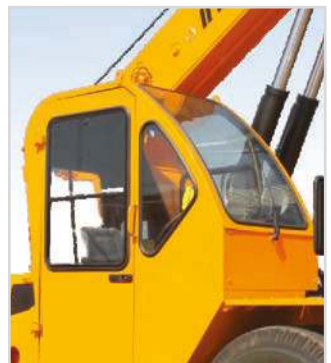
Cabin with better ergonomics