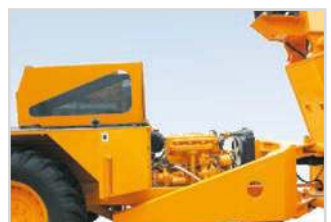
Easy for maintenance