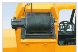
Heavy Duty Winch