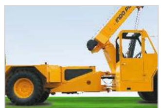
High Ground Clearance