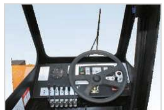
Four side more visibility cabin